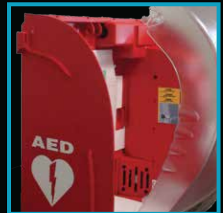
Wall mount holes 5/16" (8 mm). Security seals.