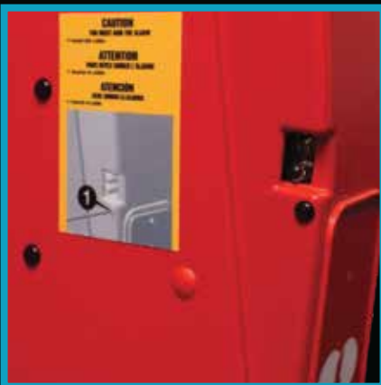
Light level sensor for automatic day/night lighting. Red and white LEDs.